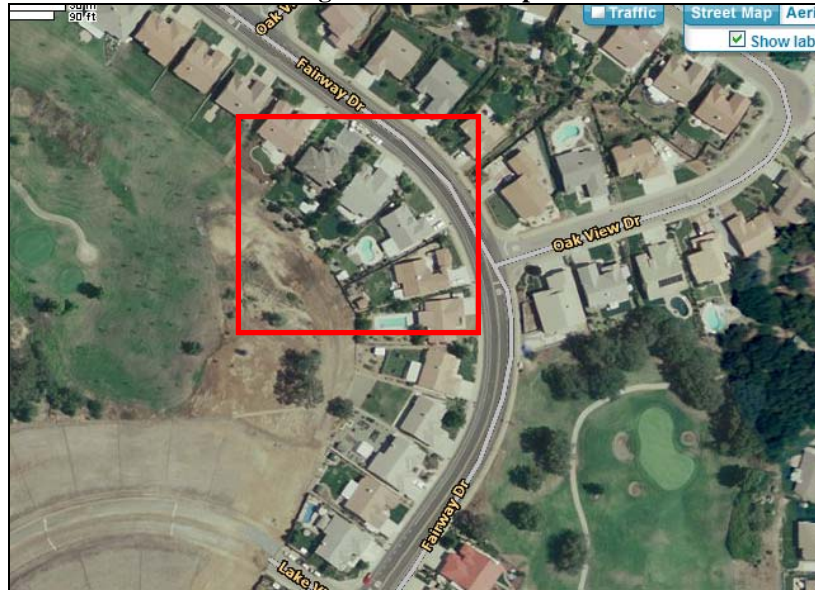
Figure 1: Aerial Map