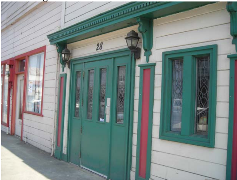
Figure 4: Enhanced Facades in Downtown

The provisions of Chapter 17.76 encourage flexibility in displaying the Mother Lode style and encourage projects to improve the architectural quality of downtown. The enhancements of the proposed project would strengthen and improve the architectural style of the building. Window and door trim would be replaced and repainted with like or substantially similar materials, and the overall facia of the structure would be enhanced. These are significant improvements that would not only enhance the appearance of the structure, but also its conformity to the Mother Lode style. The replacement of the facia of the building would improve the architectural consistency of downtown and enhance downtown’s visual character. It is consistent with and fulfills the intentions of the Architectural Heritage and Preservation District.