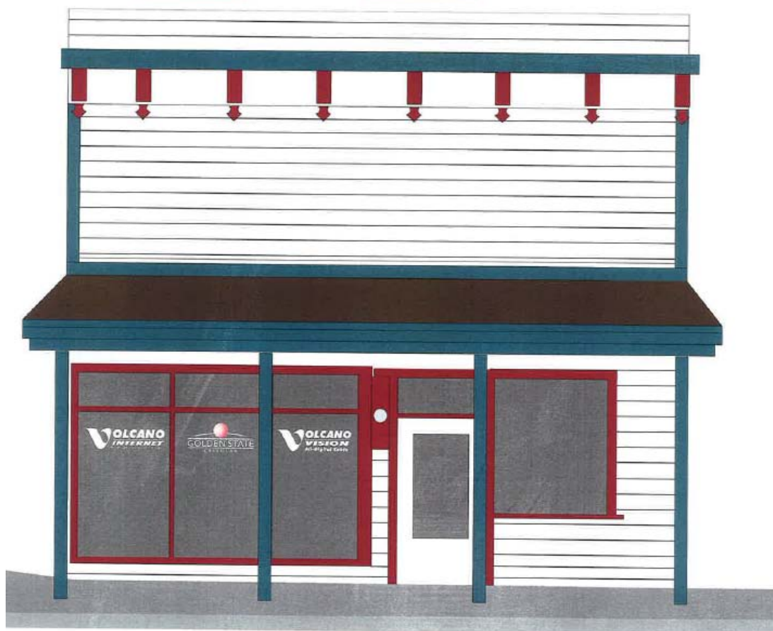
Figure 3: Proposed Facia Improvements

The proposed work is minor in scope and would create a substantial improvement to the façade of the structure at 24 W. Main Street.