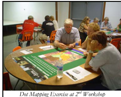
Dot Mapping Exercise at 2 nd Workshop

The input collected from participants was used to create three separate land use alternatives maps for consideration during the third public workshop.